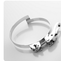
Clip-Grip Quick-Fix Clamp Special clamp for attaching all hose types from the Master-Clip series to mobile and stationary units.